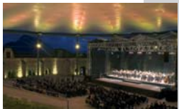
Events in the interior courtyard of the Josefsburg