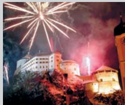
New Year's Eve in Kufstein